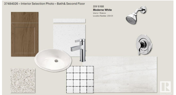
SW 6168 Moderne White Interior / Exterior Location Number: 238-C9