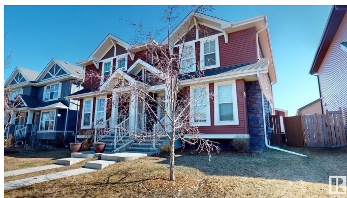
1083 Watt Promenade SW Edmonton